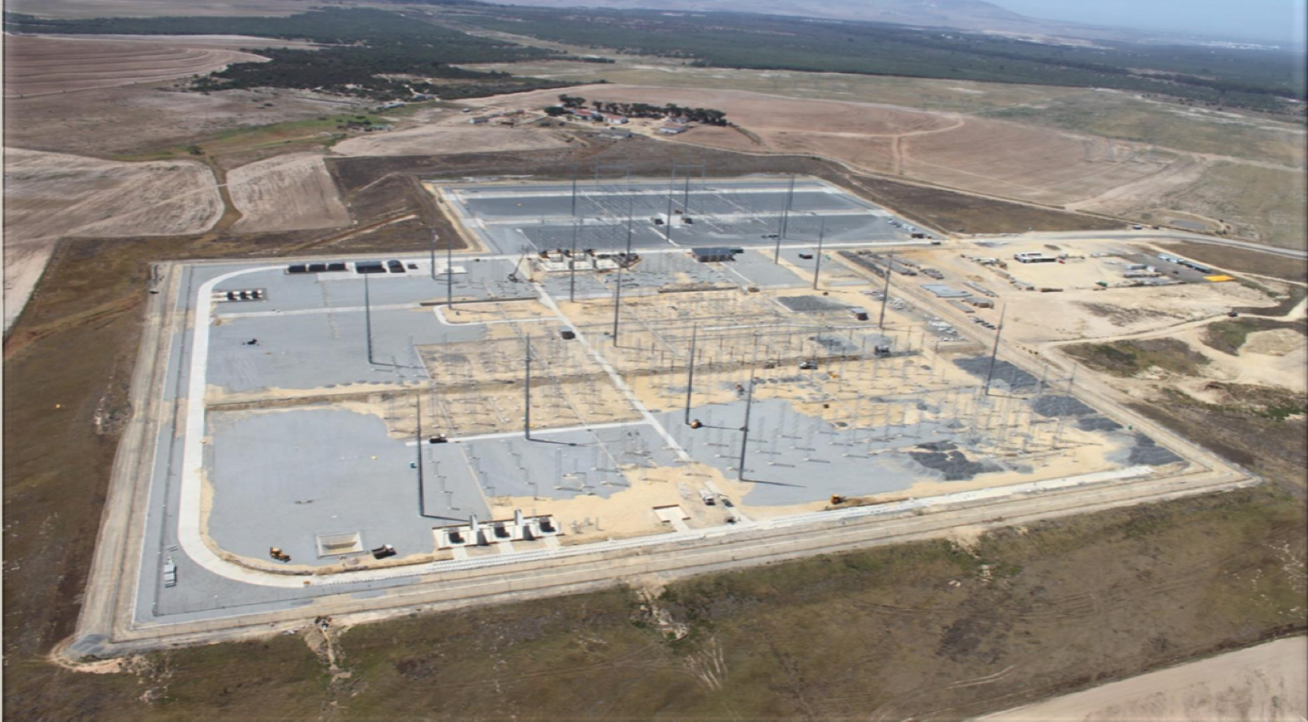
OMEGA - STERREKUS ESKOM 765 KV SUB-STATION 2008.....